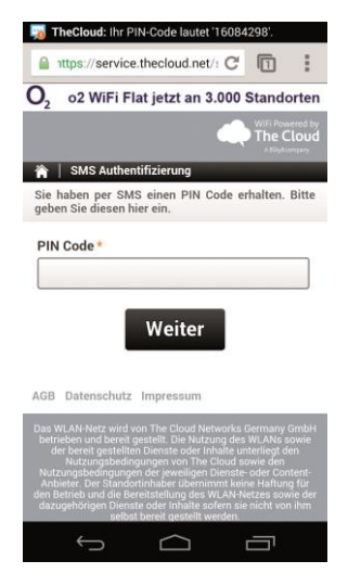
Step 7: WLAN portal

Enter the PIN you have received into the field "PIN Code". Click on "Weiter" (Continue).