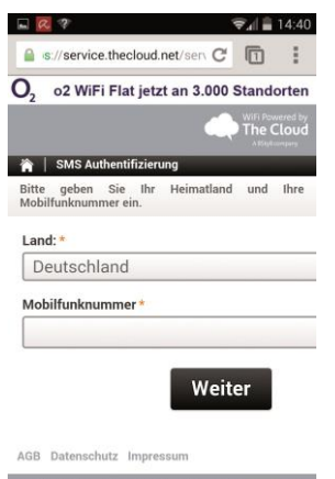
Step 6: WLAN portal

On some smartphones, this is displayed somewhat further down on the page, so scroll downwards.