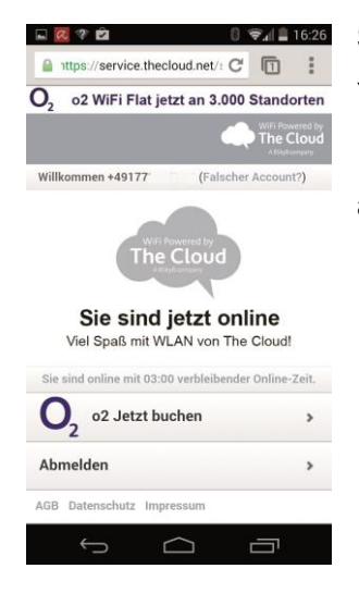
Step 8: WLAN portal

Enter the PIN you have received into the field "PIN Code". Click on "Weiter" (Continue).